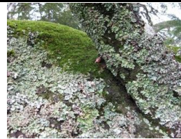
LICHENS + MOSS