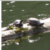
WESTERN POND TURTLE