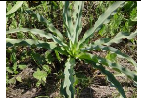
WAVYLEAF SOAP PLANT