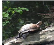
WESTERN POND TURTLE